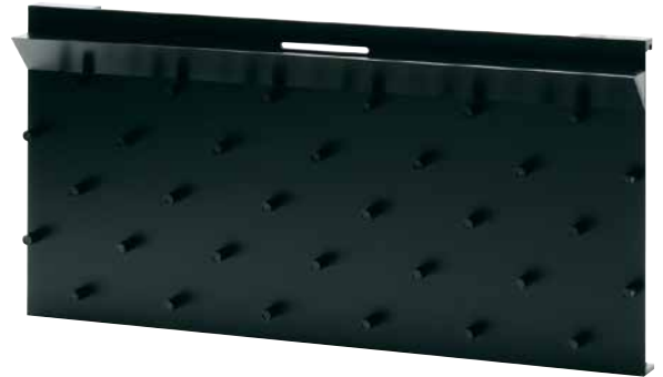
Mizukusa Wall 60

“DOOA Mizukusa Wall 60” is newly released after changing some of the specifications of DOOA Wabi-Kusa Wall 60. By using Wabi-Kusa Mat and Wabi-Kusa with it, the ADA’s original aquatic plant cultivation system let you enjoy beautiful scenes of developing leaves of aquatic plants above water with full of natural feels on the wall. It can be used with a separately sold Super Jet Filter ES-150 Ver. 2. For this time, it is made of black acrylic instead of clear acrylic. Please use this product with DOOA Neo Glass Terra (H36) and Cube Garden 60P (W60xD30xH36cm), or install a separately sold Mizukusa Wall Stand 60, and use it with DOOA Neo Glass Terra (H23) and Cube Garden 60F (W60xD30xH18cm).